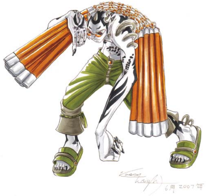
Aspiral Mavens (Angel Lion Cameo)